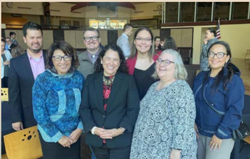
SBA Administrator Guzman with ANC compliance group members at the SBA roundtable in Anchorage, AK